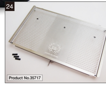
Z900RS CORE GUARD(SILVER)

One-point accent next to the radiator, easy installation by simply replacing original parts. Compatible with 2017-2020models *The 2021model cannot be used due to the radiator size change.