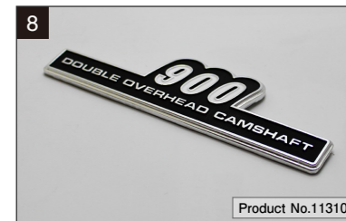
Z1 TYPE SIDE COVER EMBLEM (DOUBLE-SIDED TAPE)