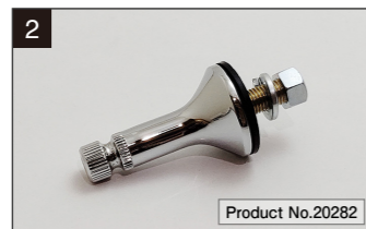
TURN SIGNAL STAY(SHORT TYPE)