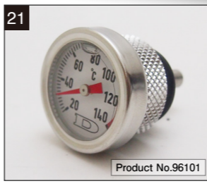
Z900RS OIL TEMPERATURE GAUGE

1piece. 12.8V, 85C / M, 1W-100W. You will need it when you replace the LED turn signal. One piece is required for one. Replace with a relay near the battery under the seat