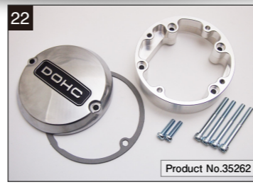
Z900RS Z1 TYPE POINT COVER SET

Mounting pitch M20x2.5. The length of the core rod is 15mm. *Do not put the sensor of this product directly immersed in oil. This product is only used to indicates the temperature inside the crankcase in which filled with high temperature scattered oil while the engine is starting.