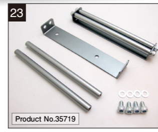
Z900RS RADIATOR SIDE ACCESSORIES

Not only can the Z1 point cover be installed, but the height has also been carefully designed to make the engine thicker and look better.