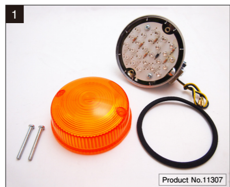
Z1 TYPE LED TURN SIGNAL(ORANGE)