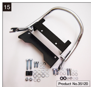
Z900RS Z1 STYLE GRAB BAR