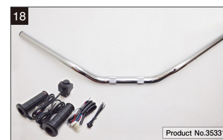
D TYPE CONCH HANDLE BAR (PLATING) WITH GRIP HEATER SET

Z1 Style slim tank cover for use with the inner tank. Exterior cover set with coloring close to the original Z1. *The tank installed to the vehicle in the image is a original Z900RS tank.