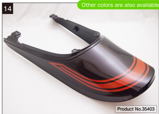
Z900RS Z1 TYPE TAIL COWL (Z900RS CANDY TONE BROWN)