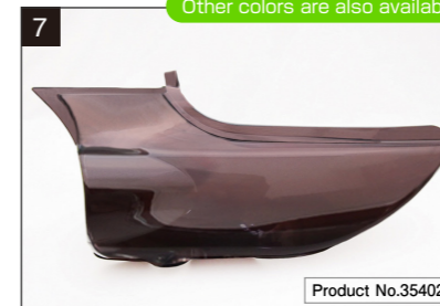
Z900RS Z1 TYPE SIDE COVER LEFT (CANDY TONE BROWN)