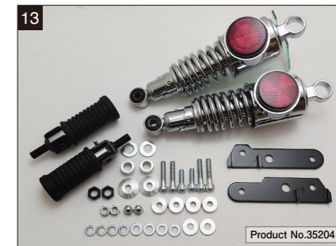
Z900RS FAKE TWIN SHOCK TYPE MUFFLER STAY