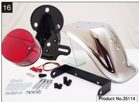
Z900RS Z1 STD TYPE IRON PLATING REAR FENDER WITH RED LAMP KIT