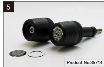
Z900RS ENGINE SLIDER