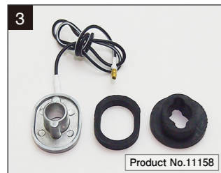
TURN SIGNAL EARTH GROMMET