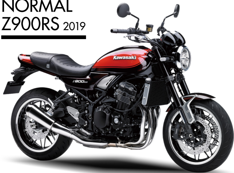
Candy Tone Brown x Candy Tone Orange