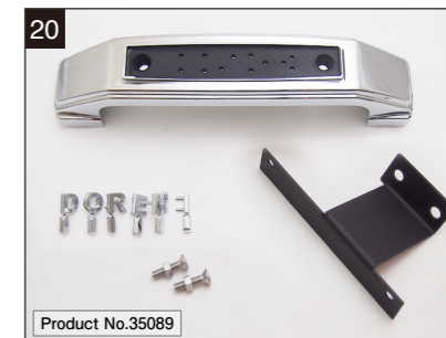
Z900RS FORK COVER EMBLEM(PLATING) DOREMI WITH STAY