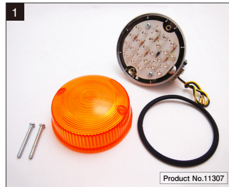
Z1 TYPE LED TURN SIGNAL (ORANGE)