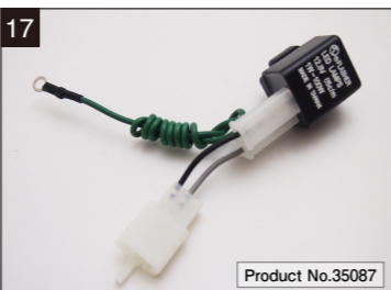
WIDE WATTS TURN SIGNAL RELAY