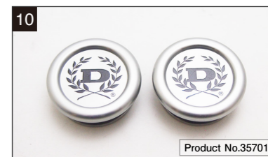
Z900RS FLAME PLUG L SIZE SILVER