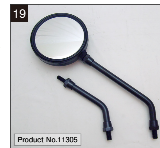
Z1/Z2 TYPE MILLOR BLACK