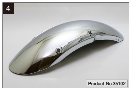
Z900RS FRONT FENDER

Bolt insertion hole 10φ. One light case mount damper set. When replacing with Z1 LED turn signal, you can remove the attached harness and use it on the front turn signal mounting part. (Use two per unit.)