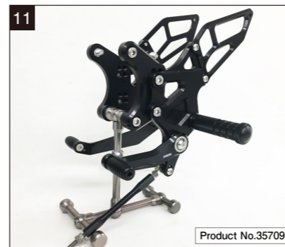
Z900RS RIDING STEP BLACK