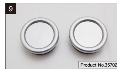
Z900RS FLAME PLUG M SIZE SILVER