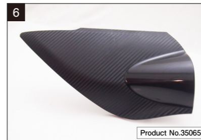
Z900RS Z1 TYPE SIDE COVER FRONT SECTION(LEFT)