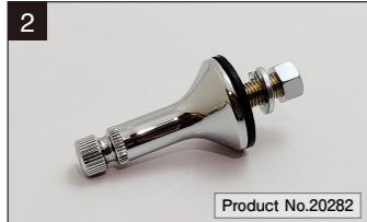
TURN SIGNAL STAY(SHORT TYPE)

• Side grip (Product No.35121) is also available for ¥13,200.